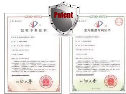
螺带结构Ribbon Agitator 螺杆结构Screw Agitator